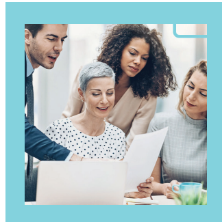
05 - Training Your Team