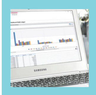
01 - Product Demo Setup