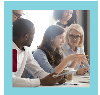
03 - Workflow Alignment